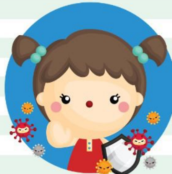
Clean and disinfect frequently touched surfaces