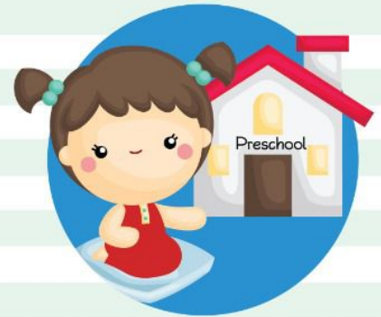
Maintain Overall Hygiene